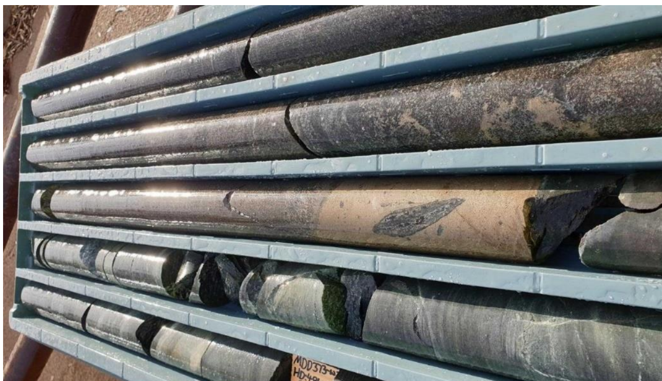
MDD373W2 intersection (4.5m @ 3.3% Ni) – massive and matrix sulphides core, prior to assays