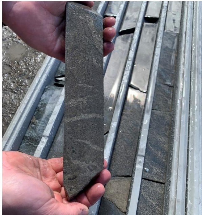
Figure 1: MDD329W2 core photo – massive sulphide diamond drill core contains mixed pentlandite and what appears to be millerite. The small brassy interval in the core tray appears to be massive fine grained millerite in amongst matrix nickel sulphides.

The intersection is part of a drilling program to be completed over the next six weeks following the recent Cassini Mineral Resource update (see ASX announcement, 26 August 2019). The new intercept includes 4.5m at 9.0% Ni and an ultra-high-grade zone of 0.4m at 16.1% Ni which includes, for the first time, the detection of millerite (the highest grade nickel sulphide species).